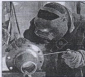
Rajah 1.1 - Kimpalan manual

Kimpalan di mana keseluruhan operasi kimpalan dilakukan dan dikendalikan dengan tangan. Oleh kerana pengimpal melakukan semua kerja secara manual, ia secara fizikal amat mencabar dan boleh menyebabkan kecederaan kepada pengimpal.